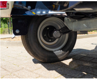
80 km/h road prove Galvanized Torque shaft suspension.