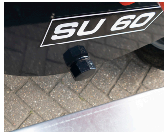
Easy to clean with a garden hose Water is easily drained via drain.