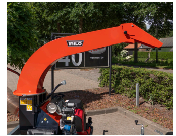
Smart designed by TRILO Square stack for superior airflow.