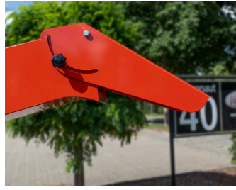
Adjustable end flap.