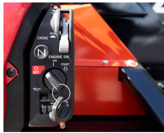
Conveniently located controls and equipped with a electrical starter.