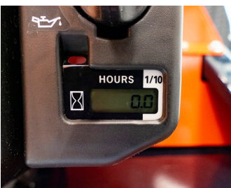
Equipped with Honda's low Oil level Alert system and a hour counter.

TRILO machines are exceptionally well engineered and will easily serve you for many years to come. Every machine is sold with premium service and warranty.