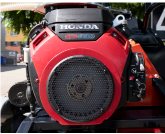
Extremely reliable 21 hp/15,5 kW GX630 Honda V-twin petrol engine.