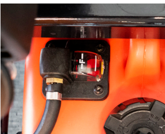
Full tank with fuel gauge.