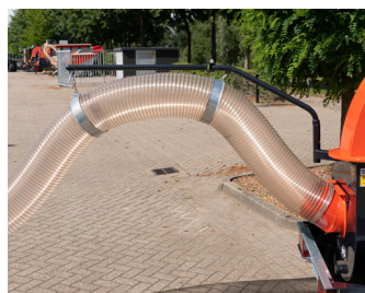
Suction hose with a 5 m radius is supported by a pivoting boom.

TRILO machines are exceptionally well engineered and will easily serve you for many years to come. Every machine is sold with premium service and warranty.