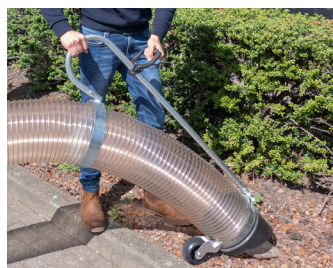
Sturdy handle with castor wheel supporting the weight while operating.