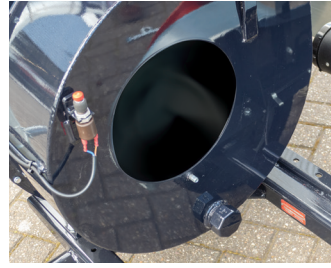
Easy access to the impeller and the wear plates for maintenance.