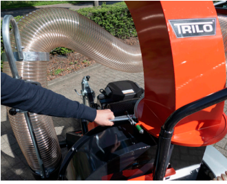
Discharge spout can be turned 360 degrees.