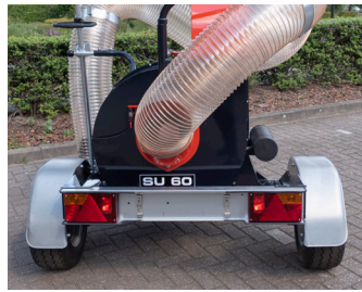
Street lights and number plate holder.